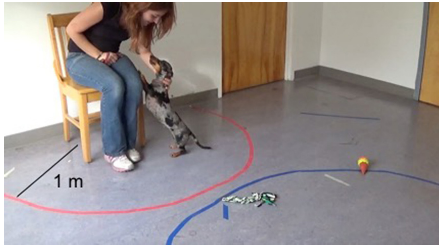
FIGURE 1 | Layout of testing room for SBT. Written consent was obtained from this participant for the inclusion of this image in the manuscript.

All tests were two tailed and had an alpha level of 0.05 unless otherwise specified. Post-hoc comparisons were made using t -tests with a Tukey-Kramer adjustment for all pairwise comparisons.