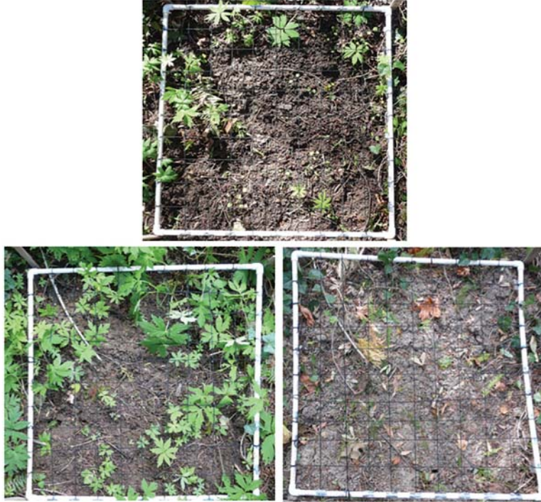
Figure 2. Example treated plot photographs after four weeks (top), after ten weeks (bottom left), and after twenty-six weeks (bottom right). This plot is representative of the average amount of growth observed in treated plots, though some plots showed much less cover and others showed much more. Individuals only observed as pairs of cotyledons, which proved difficult to identify, can be seen in each plot (see discussion).