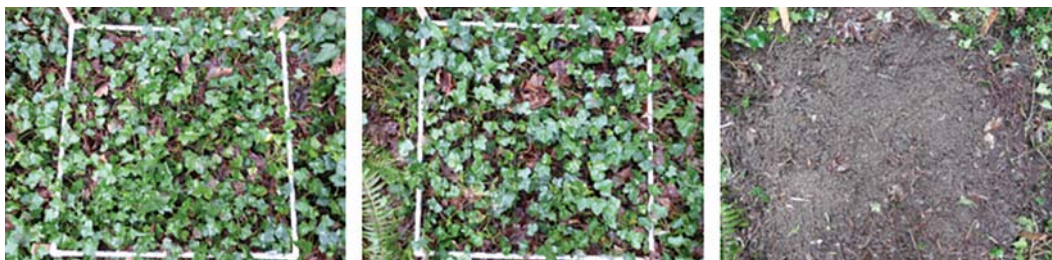
Figure 1. Example control plot (left) and treated plot photographs before (center) and after (right) manual ivy removal. Typical soil disturbance and incidental removal of detritus sustained during the clearing process is represented in the cleared treated plot (right).

All treated plots were manually cleared of ivy by hand-pulling and use of clippers on February 15th. As woody lateral stems often formed extensive under- and above-ground lattices, the entire underlying ivy network in each plot was removed. Care was taken not to tread in either plot during the removal process. Some native individuals remained after ivy removal, but most were unavoidably uprooted during the process. This effect did not appear dramatic, as the pre-treated average native plant cover for all plots excluding moss was only 10.4. Example photographs for control and treated plots before and after ivy removal are shown in Figure 1 .