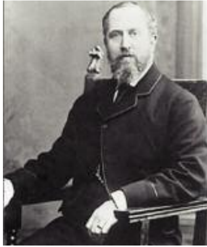
Figure 2: Lord Stanley of Preston, Earl of Derby