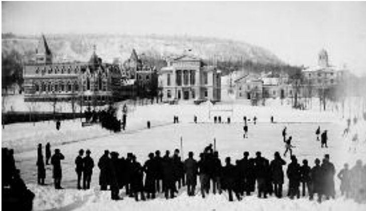
Figure 1: Hockey at the Montreal Winter Carnival 1884

Playing hockey on the skating rink, McGill University, 1884 / Montreal, Quebec.