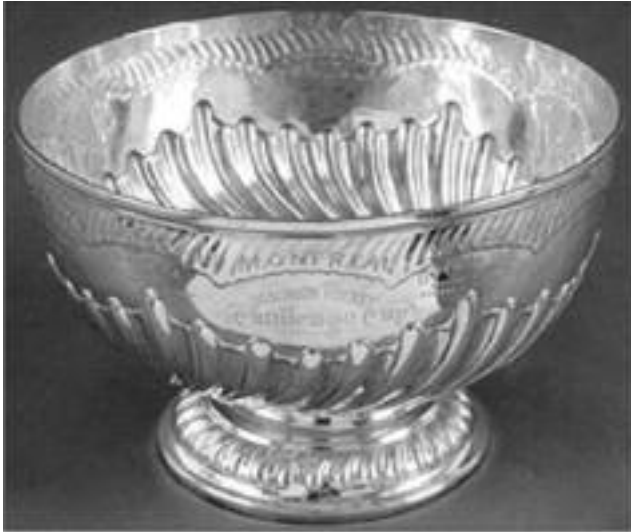
Figure 4: The Original Stanley Cup

Found at the Hockey Hall of Fame's Page, the Stanley Cup Journal: [ http://www.hhof.com/htmlSTCjournal/exSCJ08_38.shtml ]