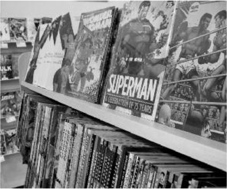
MISSISSIPPI HEROES BY SIERRA HUITT